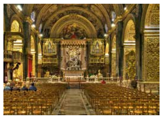
St John's Co-Cathedral

Malta: St John's Co-Cathedral, originally the conventual church of the Knights. Besides the baroque beauty of the church interior one can admire the world famous Caravaggio paintings, the Flemish tapestries and the marvellous marble inlaid floor.