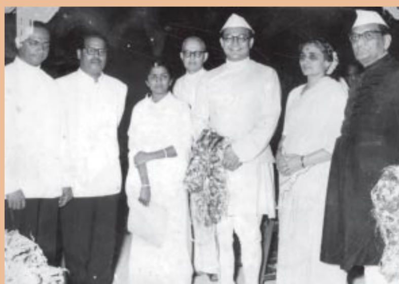
WITH LATA MANGESHKAR