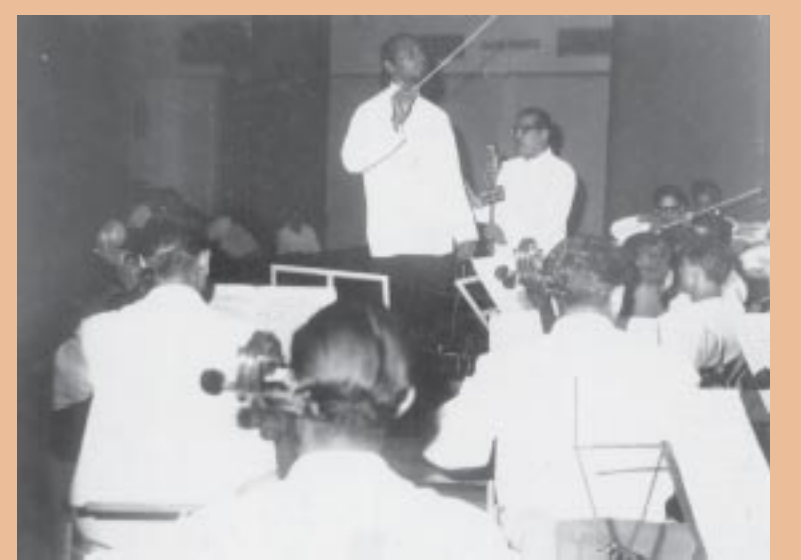
WIELDING THE BATON

(Exclusive photographs from Anthony Gonsalves' scrapbook)