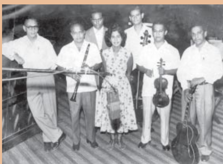
BOLLYWOOD'S GOAN MUSICIANS