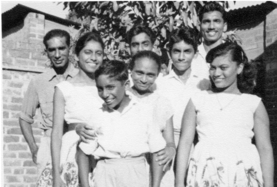
Family in Makupa Railway Quarters Mombasa