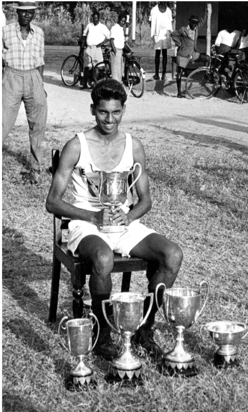
Early Years Trophies from East African Railway Championship